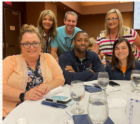
In August 2021, Century Casino Cape Girardeau team members attended the Safe House luncheon. The Safe House for Women is a non-profit organization that provides shelter and support for people who have experienced domestic abuse.