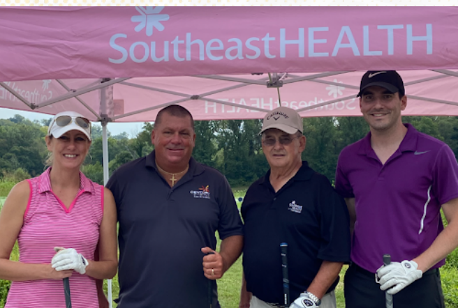
Century Casinos team members participated in the Southeast HEALTH Foundation Golf Tournament in September 2021. Proceeds for the tournament benefit programs such as transportation for hospice patients, medications for low-income patients, bereavement and counseling services and more.