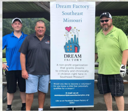
Century Casino Cape Girardeau team members participated in the Dream Factory of Southeast Missouri Golf Tournament in August 2021. This non-profit organization grants dreams to critically and chronically ill children in Southeast Missouri.