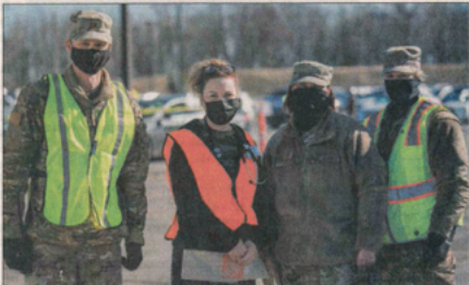
The County Health Department and Pemiscot Memorial Hospital recently helped to administer over 2,000 COVID-19 vaccines at a mass vaccination clinic in Caruthersville outside the Century Casino alongside healthcare workers and MO National Guard troops from all over the state. Those in attendance said it was highly organized, incredibly efficient and very quick and easy.