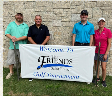
In August 2021, Century Casino Cape Girardeau team members participated in The Friends of Saint Francis Golf Tournament. Proceeds for this annual four-person scramble go to feed hungry children in Cape Girardeau.