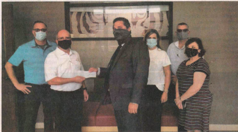
Century Casino in Caruthersville recently presented a donation to the Caruthersville Schools to help purchase school supplies for the year. The school says they are thankful for the many community partners who have stepped up to help give local students more this year despite all that they are battling.