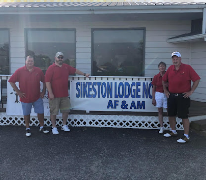
In June 2021, our team members participated in the Masonic Lodge Golf Tournament.