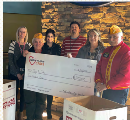
In December 2021, our Century Casino Cape Girardeau team collected toys and raised $500 for Toys for Tots through our Century Cares program.