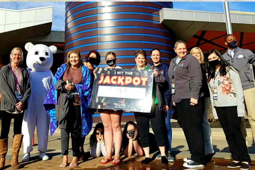
Century Casinos participated in the Polar Plunge for the Special Olympics of Southeast Missouri in February 2021. Team members paid to have ice water poured over a designated team member's head. We raised nearly $1,000,000 to support local Special Olympic athletes.