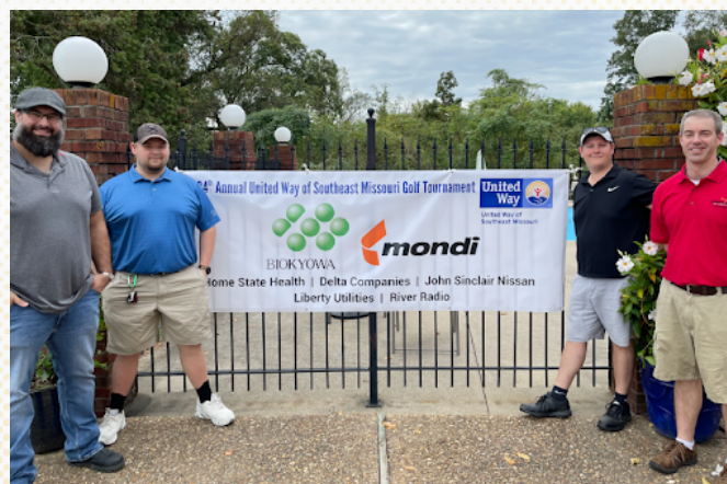
In October 2021, Century Casino Cape Girardeau team members participated in the annual United Way of Southeast Missouri Golf Tournament.