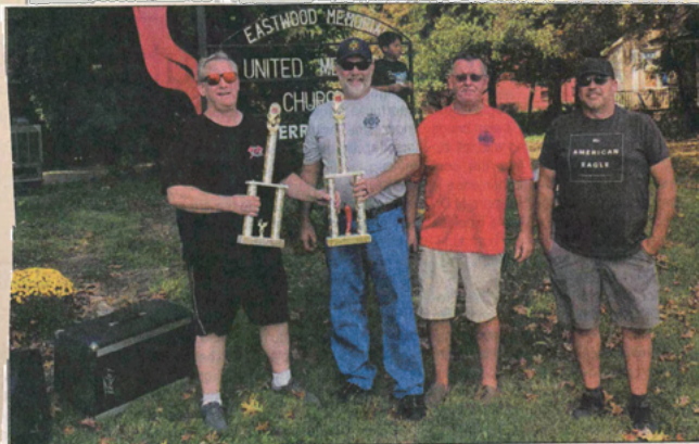
The winners of the 2021 Caruthersville Chili Cook off are: Chili - 1. Caruthersville Fire Department 2. Century Casino 3. Focus Bank Wings - 1. Arcosa 2. Sullivan's Auto & Tire 3. City of Caruthersville Dessert - 1. Church of God 2. About Life Nutrition 3. Al The Chamber would like to thank their cup sponsors this year. Caruthersville Ci teams and vendors. Hope everyone had a great time. They also want to give a