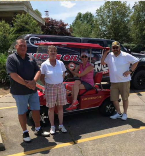
In June 2021, Century Casino Cape Girardeau team members participated in the Redhawks Golf Tournament to support the Southeast Missouri State University Athletic Department.

Support of Southeast Missouri State University Athletics Department