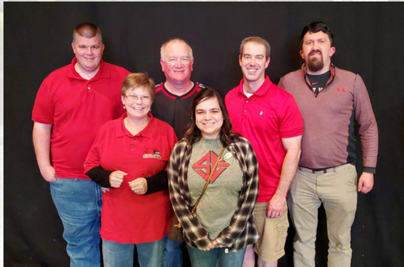
Team members participated in Redhawks Trivia Night in May 2021 and October 2021 to support the Southeast Missouri State University Athletics Department.