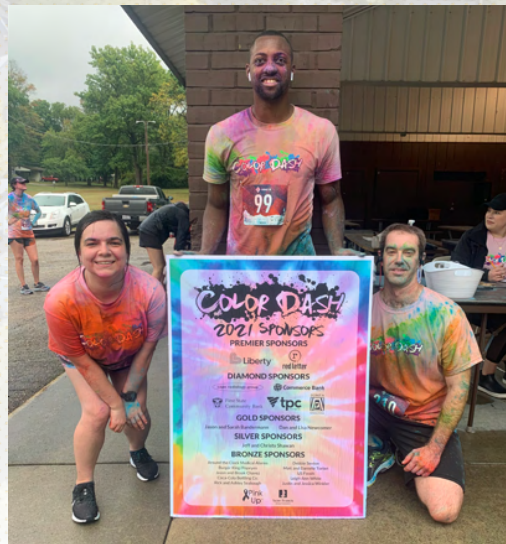
In October 2021, Century Casino Cape Girardeau team members participated in a Color Dash benefiting the Saint Francis Foundation—a non-profit organization that supports the efforts of the Saint Francis Healthcare System in meeting the medical needs of patients in the region.