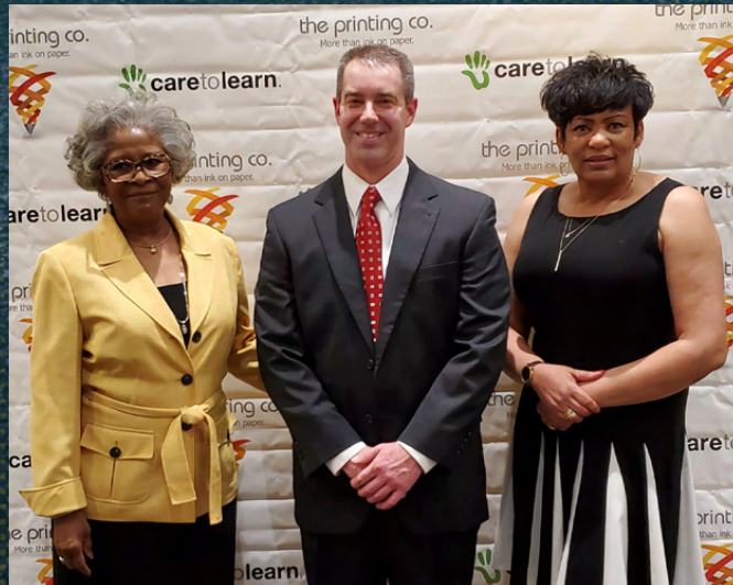
In April 2021, team members from Century Casino Cape Girardeau attended the Care to Learn dinner. Care to Learn helps students whose education is limited by the lack of basic needs, such as healthcare, hunger and hygiene.