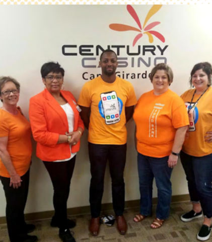
Century Casino Cape Girardeau team members wore orange attire to raise awareness about domestic hunger on National Hunger Day in September 2021.

Century Casinos is on a mission to fight hunger in our communities. During the past few years, we've provided food donations to people in need during the holidays and collected food for our local food banks. Century Casinos donated 500lbs of food in 2021. We're also working to raise awareness about the growing problem of domestic hunger through awareness projects that encourage our Century Casinos family to take action. Thanks to the generosity of our guests, team members and corporate team, we can help give back to local communities.