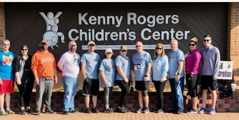
In March 2021, our Cape Girardeau and Caruthersville properties participated in the Kenny Rogers Children's Center Walk/Run.