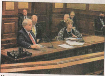
Mayor Sue Grantham alongside Senator Jason Bean during a recent Capitol session.