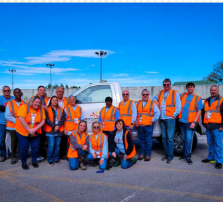
Century Casino Caruthersville participates in an Adopt A Highway program where team members volunteer to do a highway cleanup four times a year.