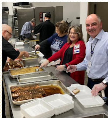
The Century Casino Cape Girardeau team prepared and served 300 meals on Christmas Day 2021 to people in need in our community through Student Santas.